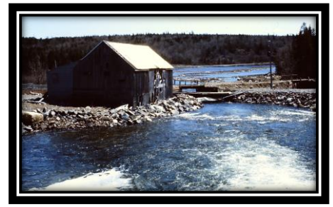
1970's - The last Days of the Pockwock Mills. The Haverstock Brothers Mill on Pockwock just before it was demolished - 1974

We are also currently putting together a presentation on 'Hammonds Plains of the 1970's'. We are trying to collect some photos of that decade to help in the presentation. If you have any which you think might be useful to us, please contact us via haverstockdave@gmail.com .