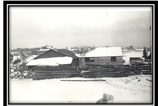
Typical of what commerce looked in Hammonds Plains for much of 20 th century. Photo of Eisenhower Mill – at site of present day Hatfield Farms.

Would you be surprised to learn that the most common occupation listed fro Hammonds Plains on the 1851 census was that of farmer?