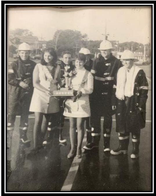
Happy Faces from members of the Hammonds Plains Volunteer Fire Department after accepting their trophy as part of the regional Firefighters competition – 1970's

Donations will also be graciously accepted.