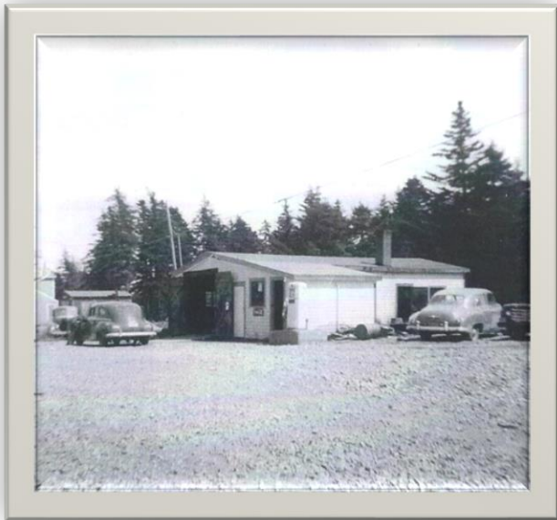
One of the first auto service centers in Hammonds Plains. This photo from 1956 is of the White Rose Service Center, operated by Roy Eisenhauer. It was located next to the present-day Fire Station.