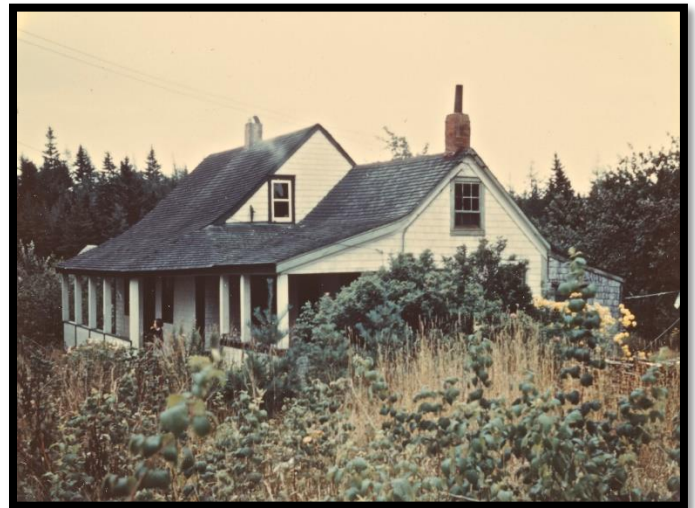
The Bezanson House – Taken in the mid 1950's